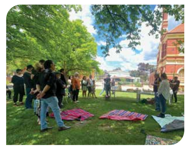
Above: The Shire's newest residents who moved to town as part of the Welcome to Central Goldfields project came together for a picnic at Station Domain in October.

Businesses and community leaders have been working together on a pilot project to attract skilled migrants to the Shire.