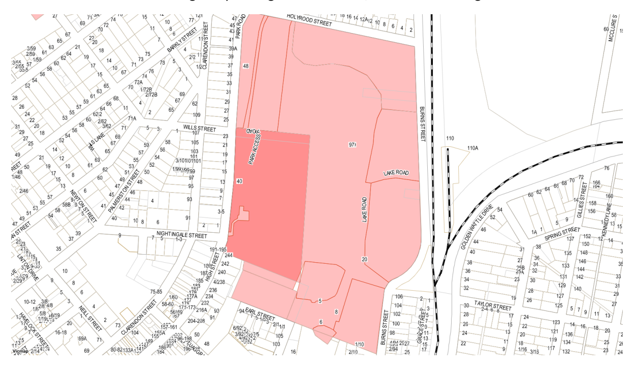
Princes Park Precinct Including Maryborough Caravan Park, T.L. Stone Kindergarten