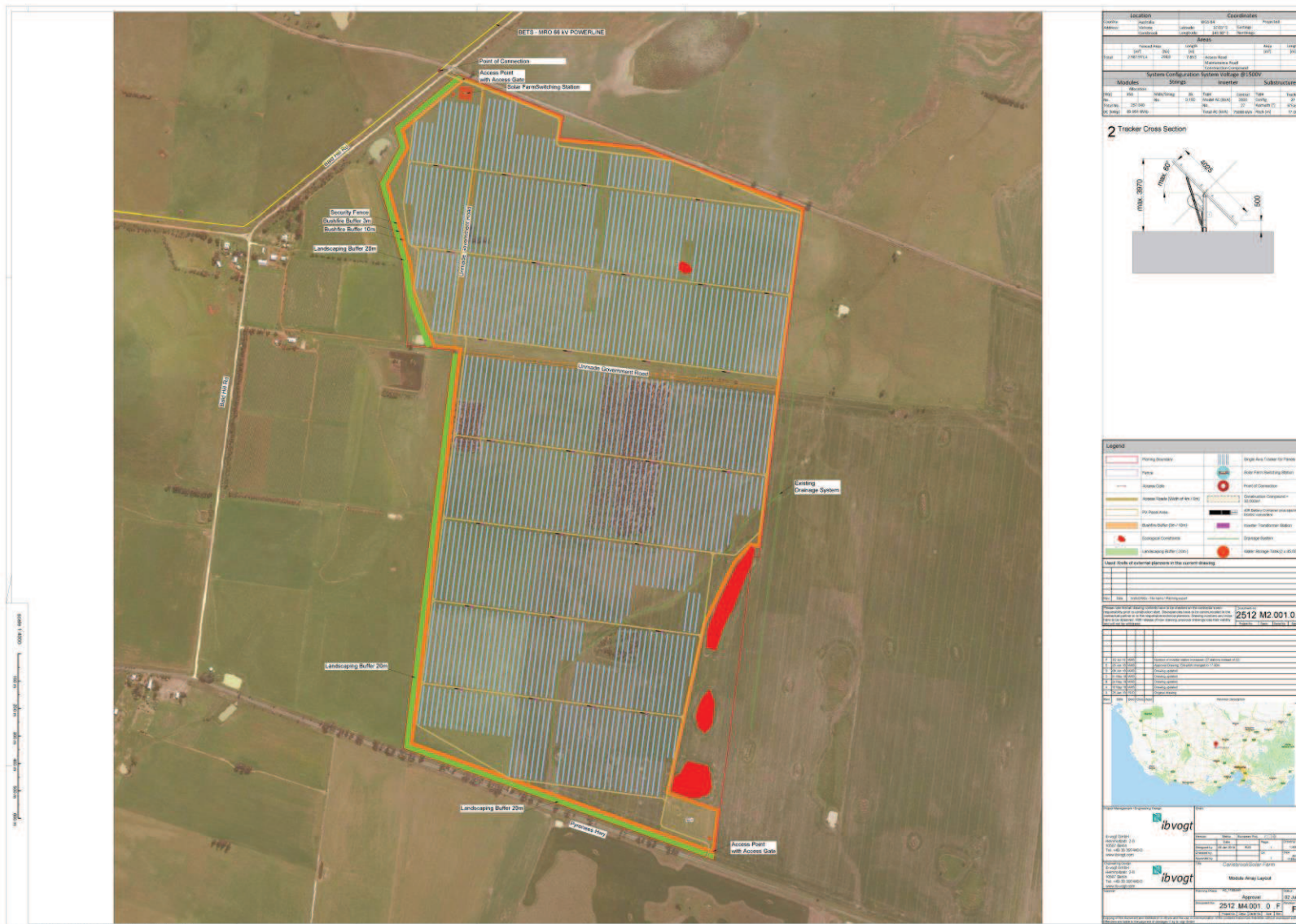
Map 2 Map of Activity Area (ib vogt GmbH)