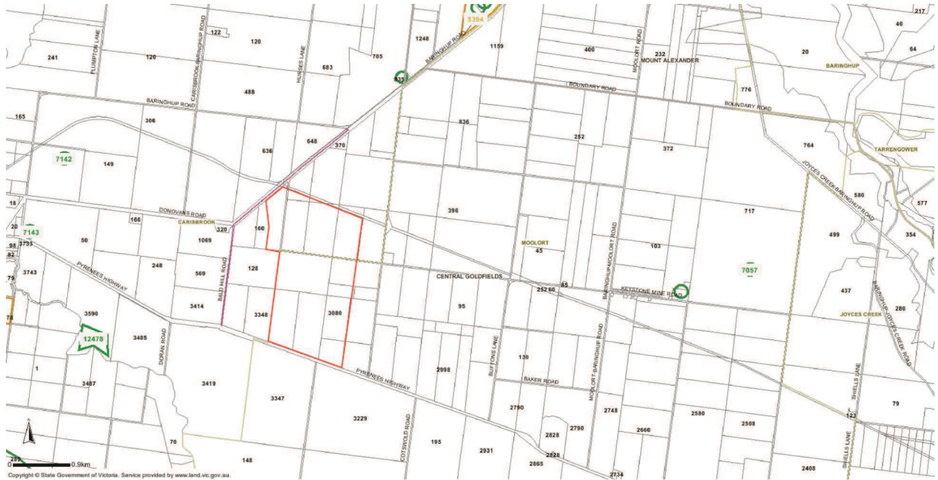
Map 3 Map of Activity Area (indicative in red) (HERMES)