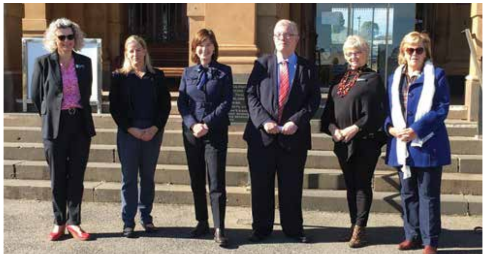
Pictured L to R:

For more information visit: www.engage.cgoldshire.vic.gov.au