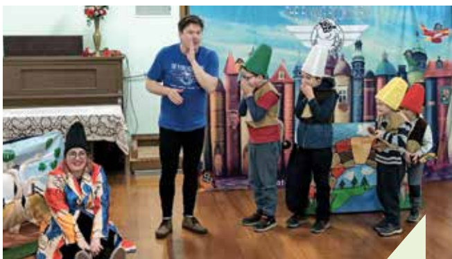
Sand-art workshops and a visit from the Flying Bookworm Theatre Company were popular activities as part of the Library's July school holiday program (pictured above).